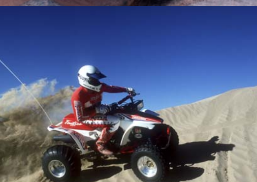
The sand dunes at Little Sahara Recreation Area near Delta