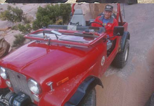
Testing skills in Utah's outback, Moab annual Jeep Safari