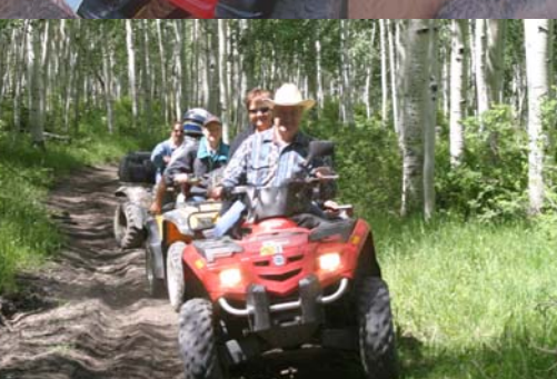
Enjoying the quaking aspen along the Arapeen Trail