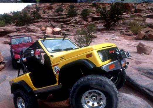
Rock crawlers negotiating the Moab slickrock