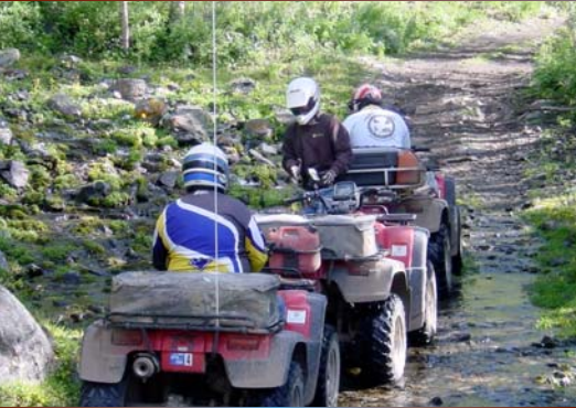
Family outing in the northern Utah mountains