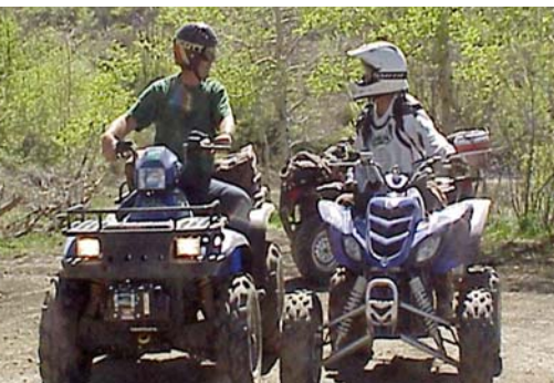
Rest stop along the Paiute ATV Trail

● ATV/Motorcycle Trails ● Snowmobile Trails