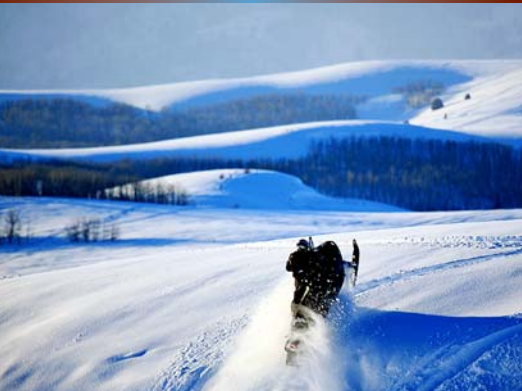
Sledding at Monte Cristo, Uinta-Wasatch-Cache National Forest