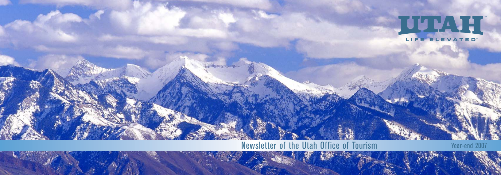
Lone Peak centers a view of the winter Wasatch as seen from the Salt Lake Valley, Steve Greenwood