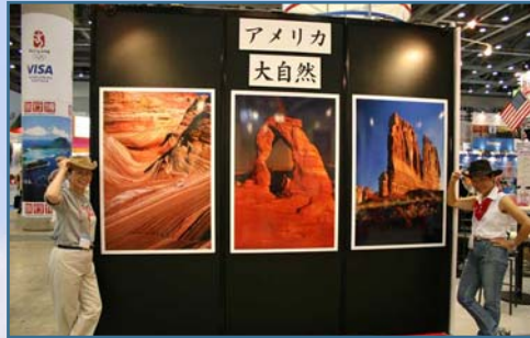
The Utah Gallery showcased some of the state's most spectacular places at Japan's JATA World Travel Fair in Tokyo

The JATA (Japan Association of Travel Agents) World Travel Fair was held in Tokyo, September 14-16, 2007. The show enjoyed 107,078 visitors of which 38,376 were travel professionals/media and