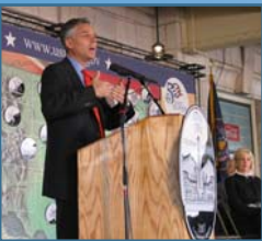
Governor Huntsman at the quarter launch celebration