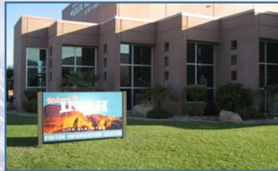
Frontscape with new "Welcome to Utah" sign

The St. George Welcome Center, the state's busiest tourist information facility, has opened at a new interim location at the Dixie Convention Center in St. George. The former