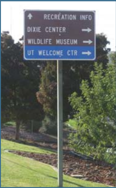
Freeway and surface street signs placed by UDOT to direct motorists to the new welcome center

40 at Jensen outside Vernal, I-70 WB at Thompson Springs, 23 miles east of Green River and at Historic Council Hall, 300 N. State, SLC.